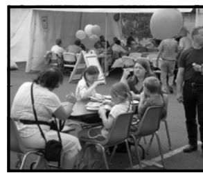
A family taking a break from the festivities to have a bite