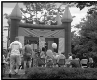
Families enjoying the bounce castle