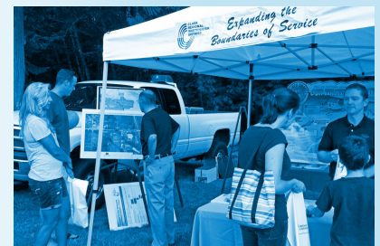
District staff are available to speak at your community gatherings.