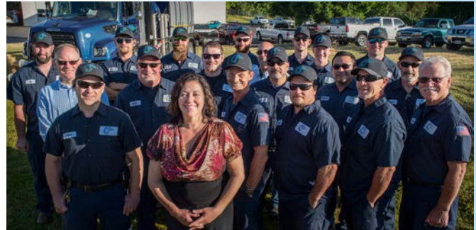
Operations and maintenance personnel

Please reach out if you have questions, concerns or suggestions. We're here to help.