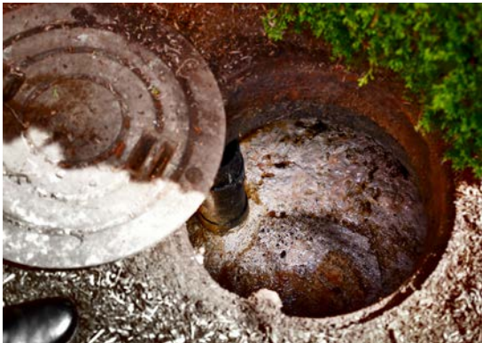
Commercial grease interceptor

Recipes and more at bit.ly/crwwdgreenclean