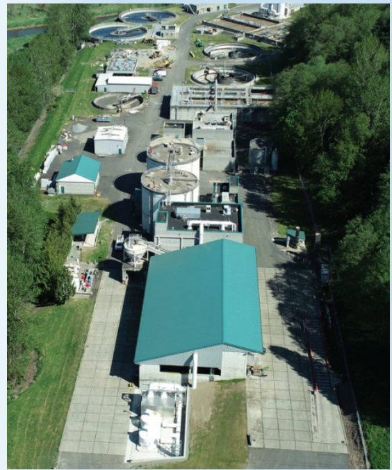
The Salmon Creek Treatment Plant.

Over the last five years, District monthly rates have increased by $4 as compared to an average increase locally over that same period of $8. Rate pressures, however, are increasing as expenses and inflation continue to rise.