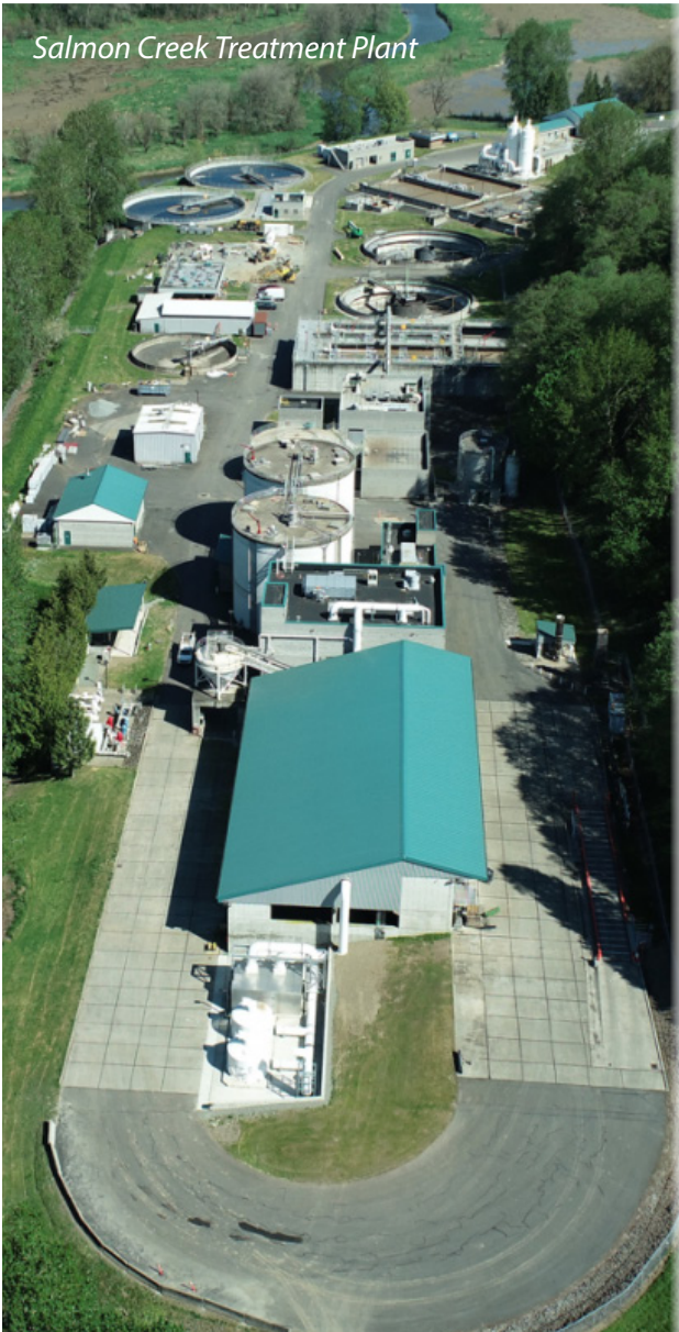
Salmon Creek Treatment Plant